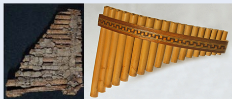
Ancient and modern panpipes, precursors to the organ

Looking at definitions of the ugav , it would appear to be a panpipe-type instrument, and likely to have been a long end-blown flute of the kind found in Egypt and Sumeria.