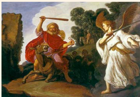
‘Balaam and his Ass’ c. 1620 by Pieter Lastman

The background to the Mah tov v text involves a prophet, a king, an angel and a talking donkey. A non-Jewish prophet, Balaam, was appointed by Balak, king of the Moabites, to curse the Jews, his enemies. The donkey, on which Balaam rode, saw an angel holding a sword, and repeatedly blocking the donkey’s path. Assuming that the donkey was misbehaving, Balaam hit the donkey three times with his staff, as he could not see the