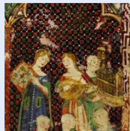
Kaufmann Haggadah , Catalonia, ca. 1370, folio 3vs.